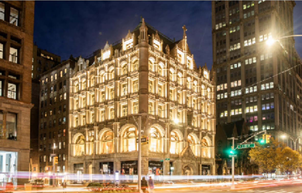
Fotografiska | New York

Discounted and special offerings with aligned brands and services including Equinox, Sonos, WeTransfer and more.