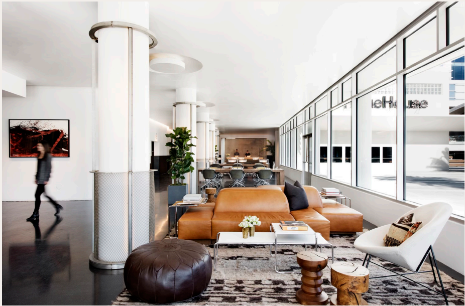
Hollywood Los Angeles