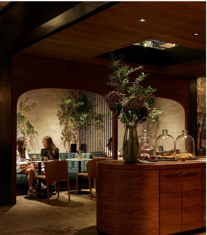
Gallery Bar | Madison Square