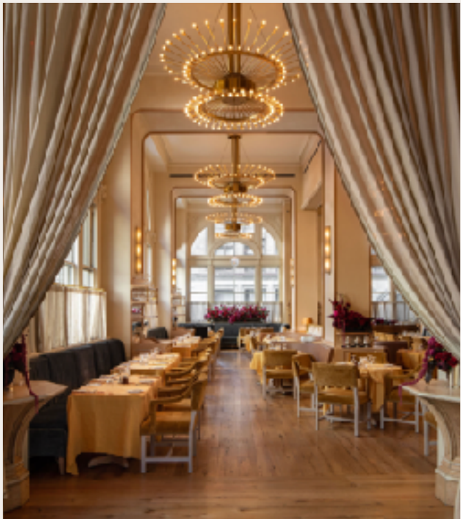
Veronika | Fotografiska NY