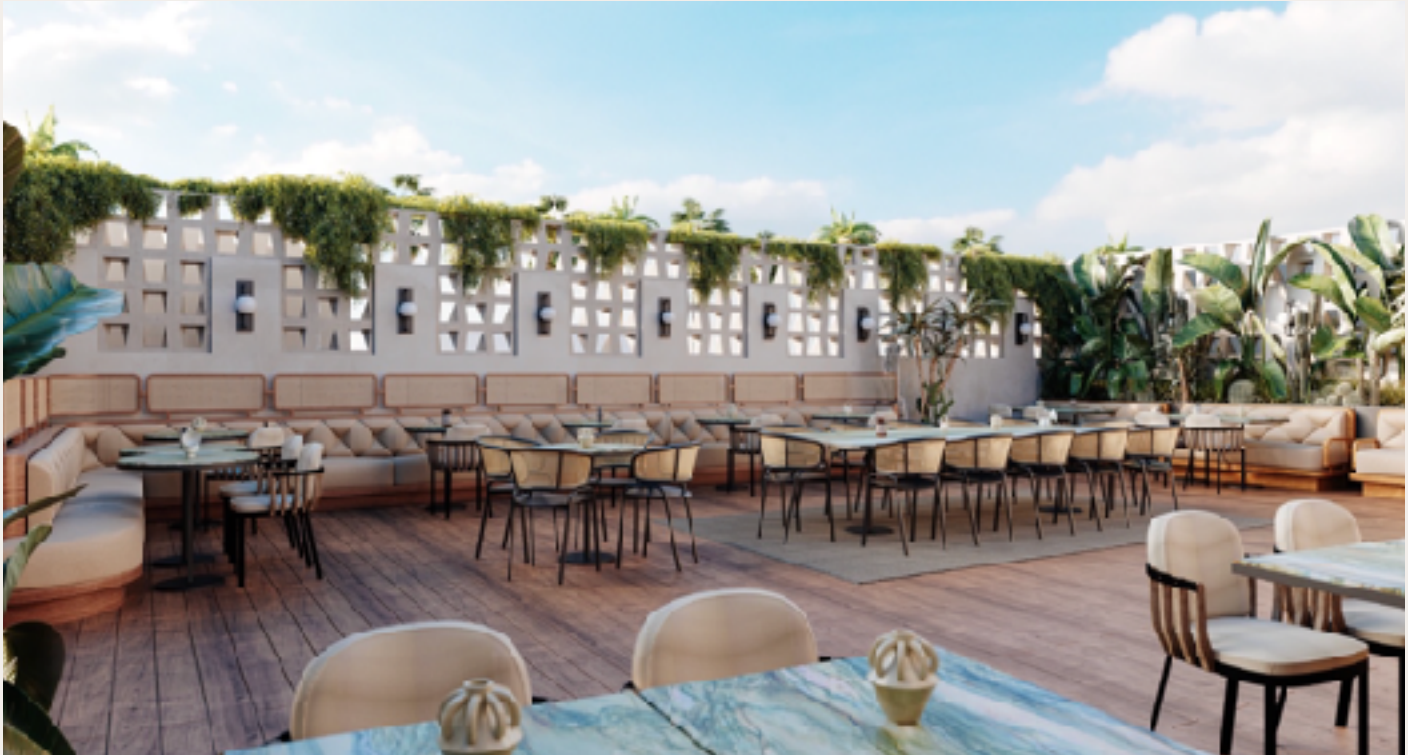
Reunion | Venice Beach, Hollywood, Miami