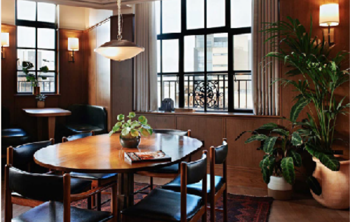
Mortimer House | London