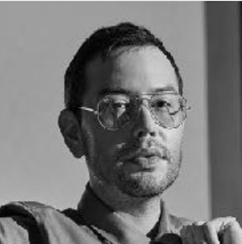
Tommy Pico Indigenous (Kumeyay) Writer