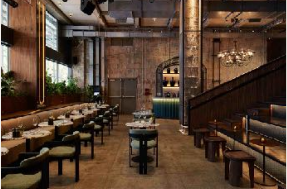
Madison Square New York