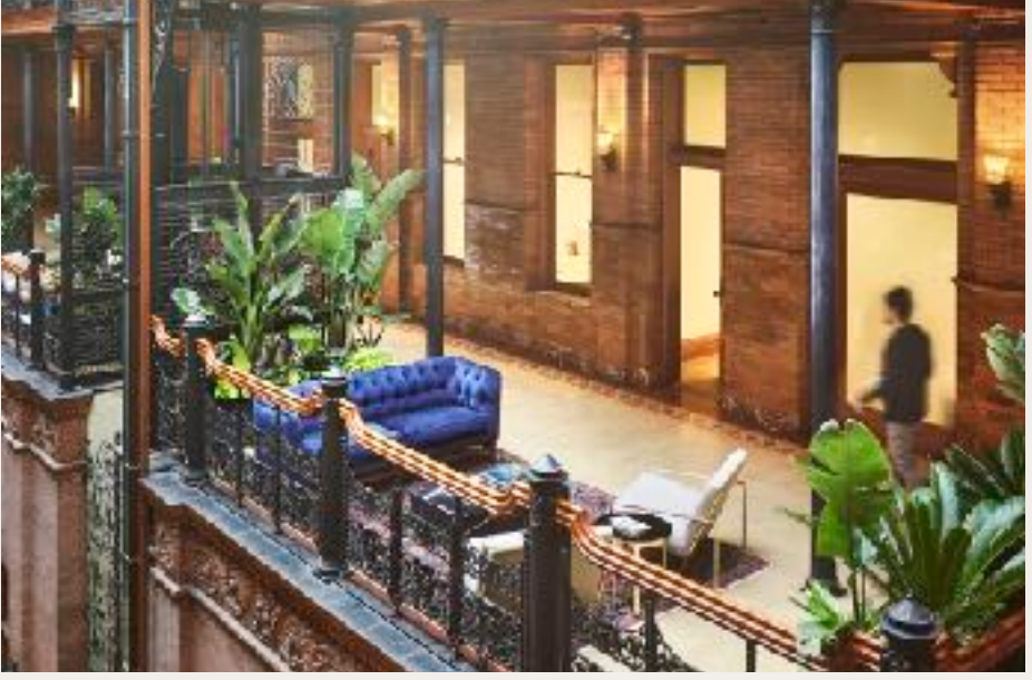
Bradbury Los Angeles