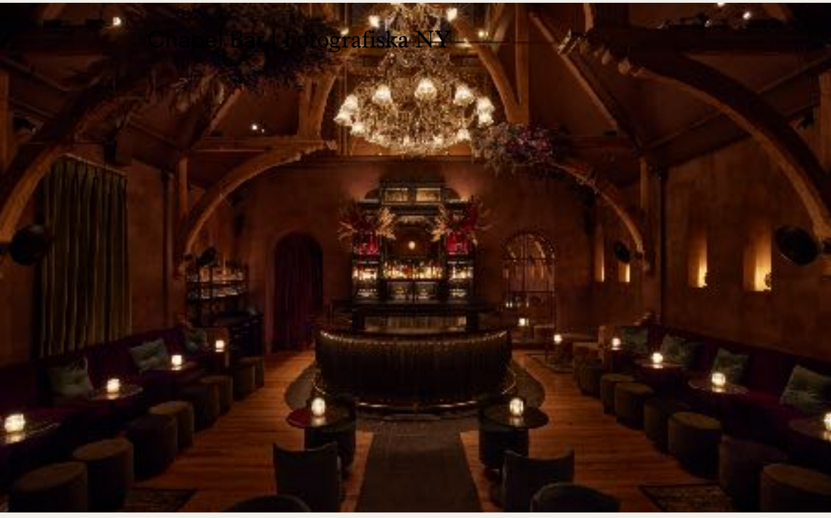
Chapel Bar | Fotografiska NY