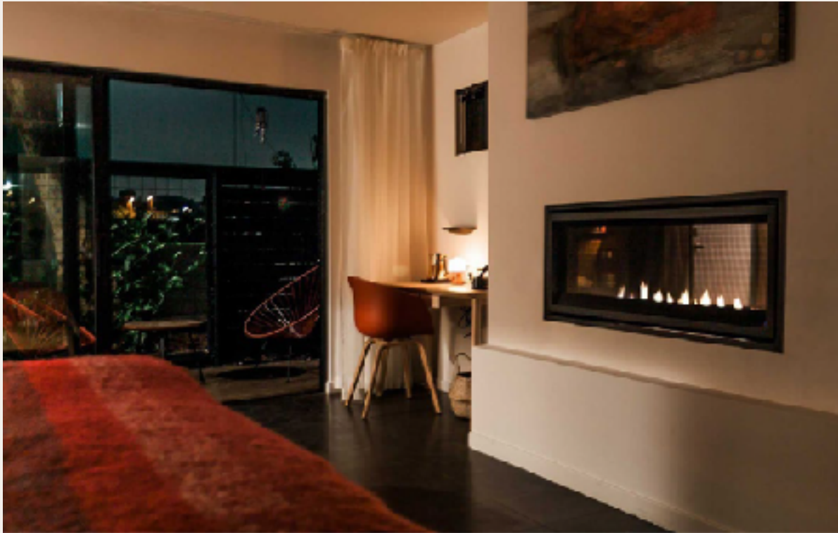
Twelve Senses Retreat | Encinitas, California