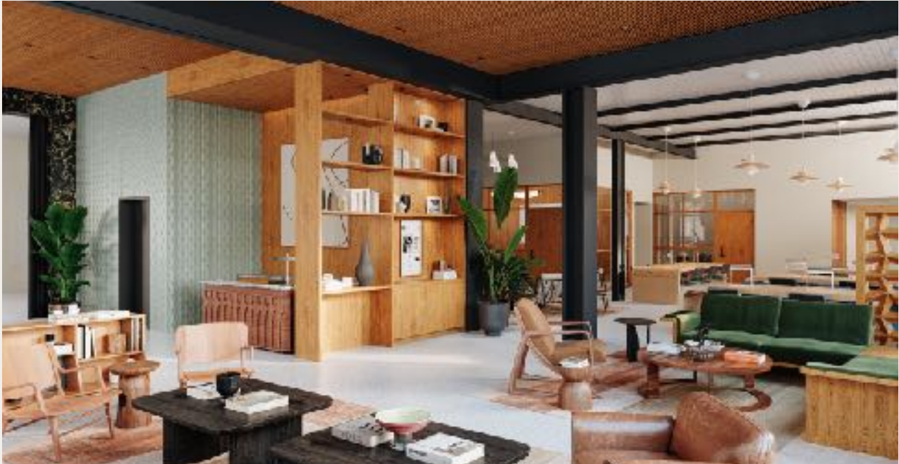
Venice Beach Opening November 2022