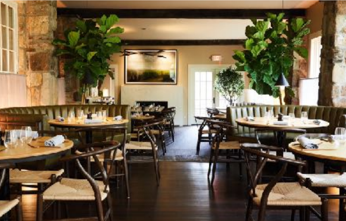
Troutbeck | Amenia, New York