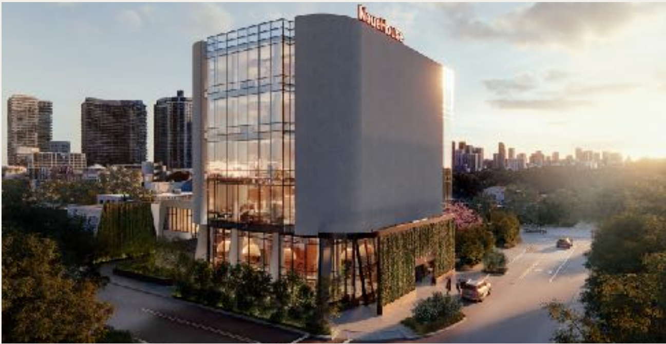
Miami Opening 2023

From the original CBS Studios in Hollywood to the landmarked Bradbury Building in DTLA, NeueHouse occupies architecturally iconic buildings rich with history and cultural significance.